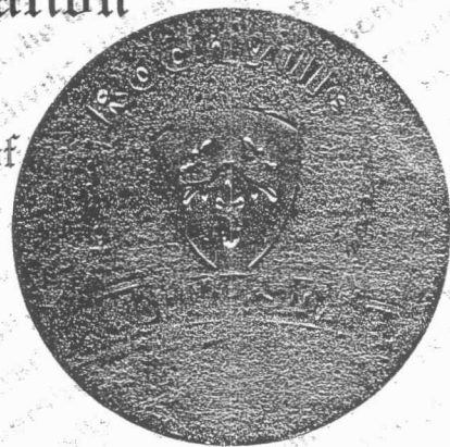
President of the University